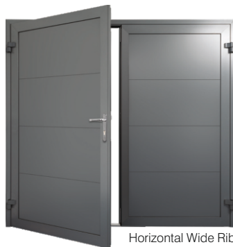
Horizontal Wide Rib

Transform your home's curb appeal with our exquisite insulated side-hinged garage doors. Choose from our diverse panel designs featuring horizontal or vertical ribs, and elevate your garage's look with a modern or classic handle.