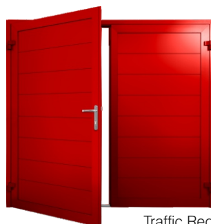
Traffic Red RAL 3020