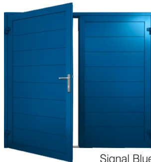
Signal Blue RAL 5005