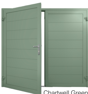
Chartwell Green BS 14 C 35