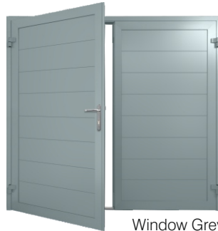
Window Grey RAL