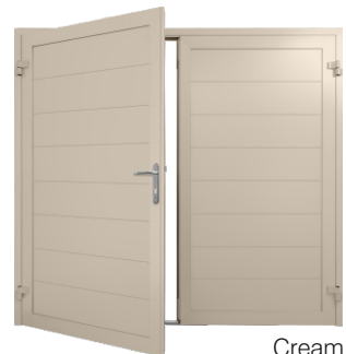
Cream RAL 9001