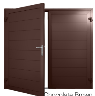
Chocolate Brown RAL 8017