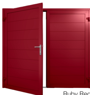
Ruby Red RAL 3003