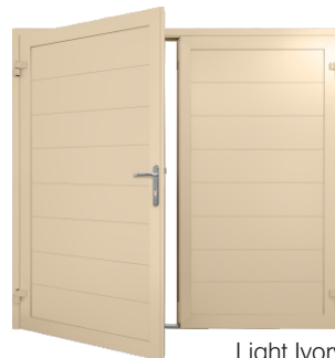
Light Ivory RAL 1015