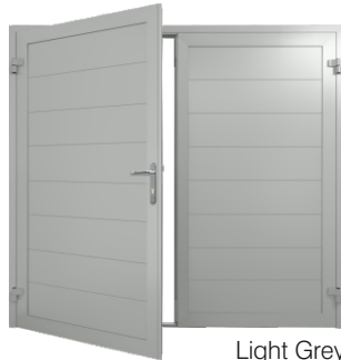
Light Grey RAL 7035