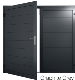
Graphite Grey RAL 7024