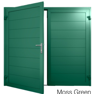
Moss Green RAL6005