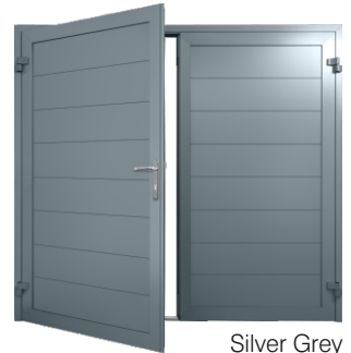
Silver Grey RAL 7001