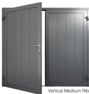
Vertical Medium Rib