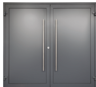
Solid shown closed