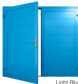
Light Blue RAL 5012