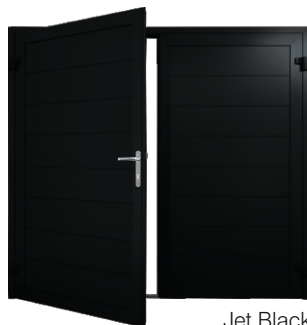
Jet Black RAL 9005