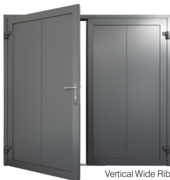
Vertical Wide Rib