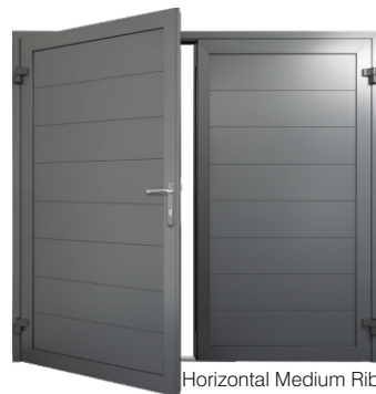
Horizontal Medium Rib