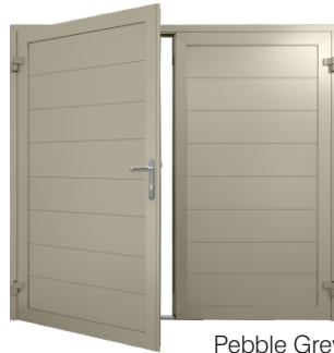
Pebble Grey RAL 7032