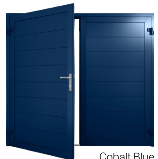
Cobalt Blue RAL 5013