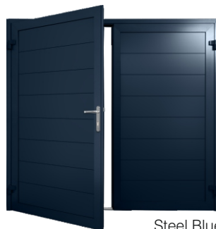
Steel Blue RAL5011