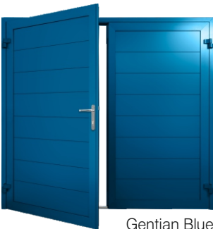
Gentian Blue RAL 5010