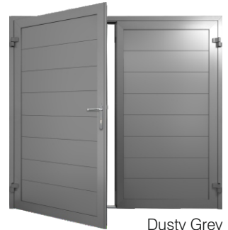
Dusty Grey RAL 7037