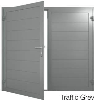
Traffic Grey RAL 7042