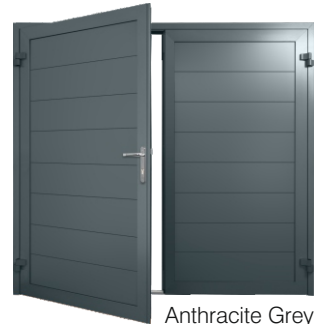
Anthracite Grey RAL7016