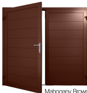
Mahogany Brown RAL 8016