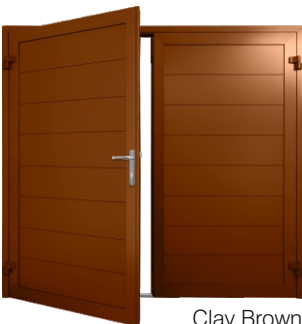
Clay Brown RAL 8003