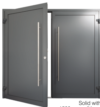
Solid with 1500mm pull bars (1200mm also available)