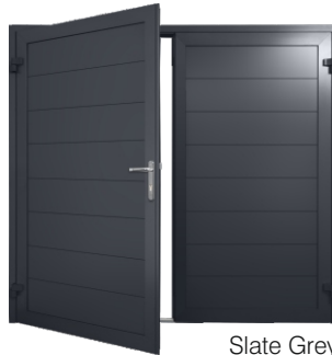
Slate Grey RAL 7015