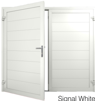
Signal White RAL 9003

long-lasting beauty, and all doors feature colour-matched hinges for a seamless look.