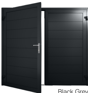
Black Grey RAL 7021