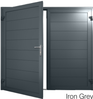
Iron Grey RAL 7011