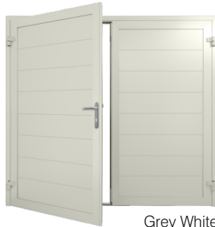
Grey White RAL 9002